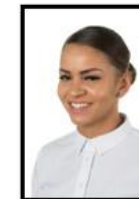
Lead DSL, Vice Principal, Behaviour, Safeguarding & Attendance Ext 732 Room 0-06

Take immediate action and report safeguarding concerns to the safeguarding team.