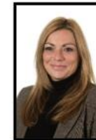
Deputy DSL, Head of Safeguarding Ext 731 Room 136